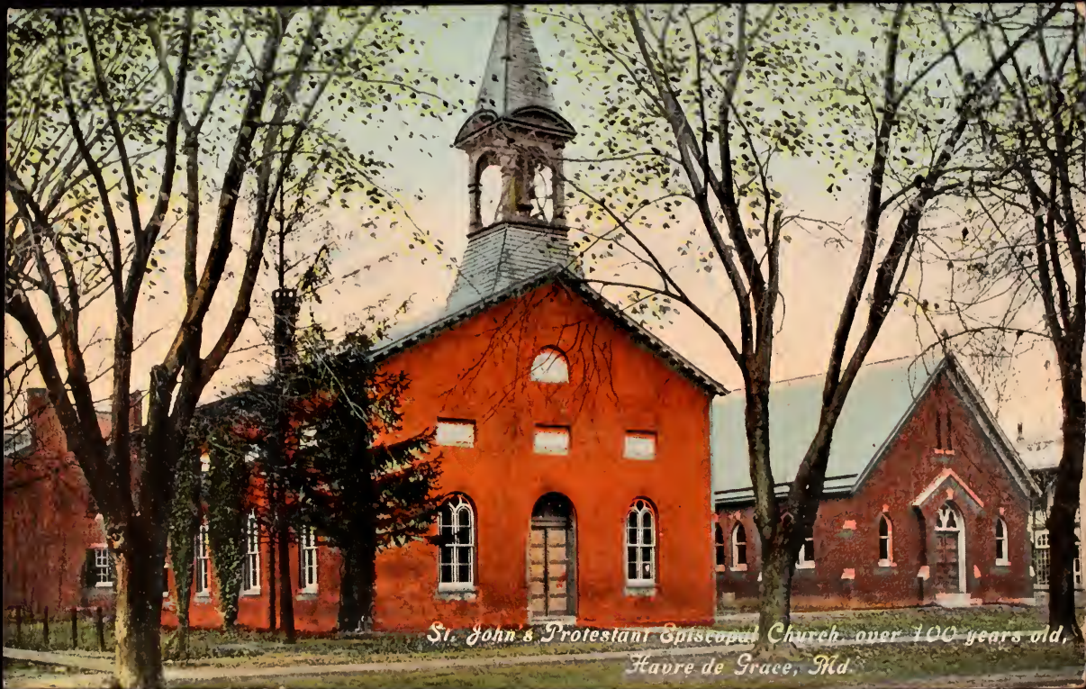
St. John's Protestant Episcopal Church, over 100 years old, Havre de Grace, Md.